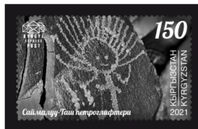
Sunhead · M173