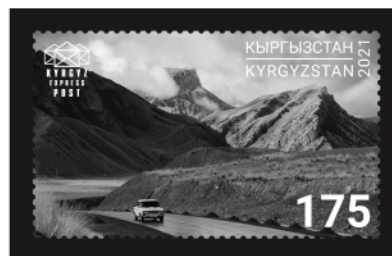
Mountain valley · M182