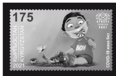
Boy wearing a mask · M180