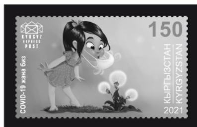
Girl wearing a mask · M179