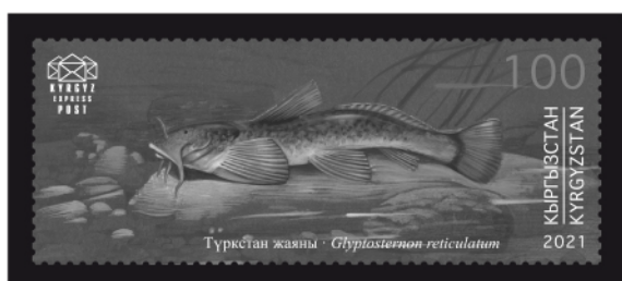
Turkestan Catfish · M168