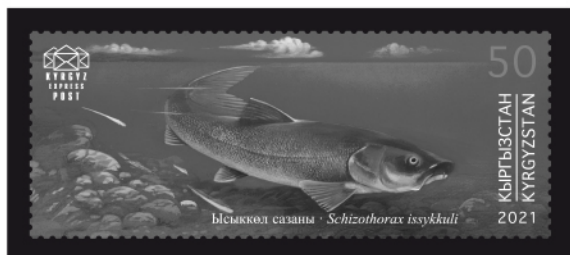
Issyk-Kul Marinka · M166