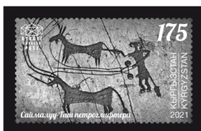
Agriculture · M174