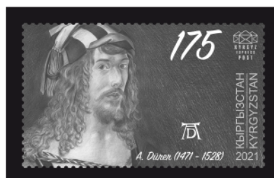
Albrecht Dürer · M186