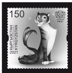
Happy New Year! · M187