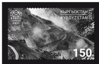
Mountain serpentine · M181