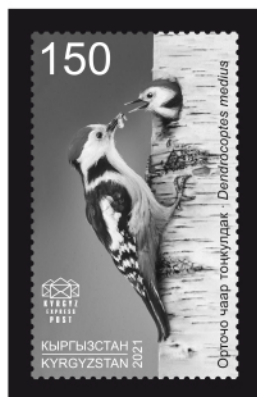
The Middle spotted woodpecker · M177