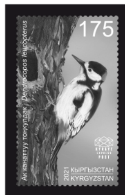
The White-winged woodpecker · M178