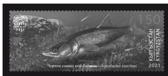
Pike Asp · M169