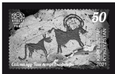
Animals · M172