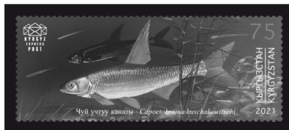
Eastern Ostroluchka · M167