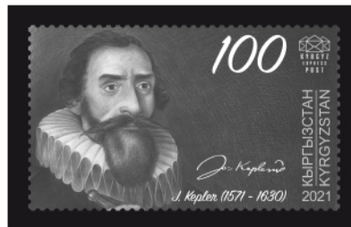
Johannes Kepler · M184