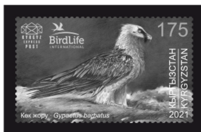
The Bearded Vulture · M170